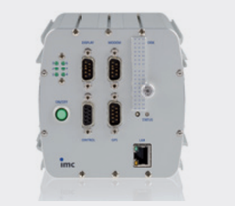
imc BUSDAQ-X, multi-bus/multi-protocol data acquisition system